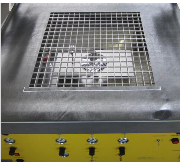
Aerosol generator and fan on the test bench of the AFS 155