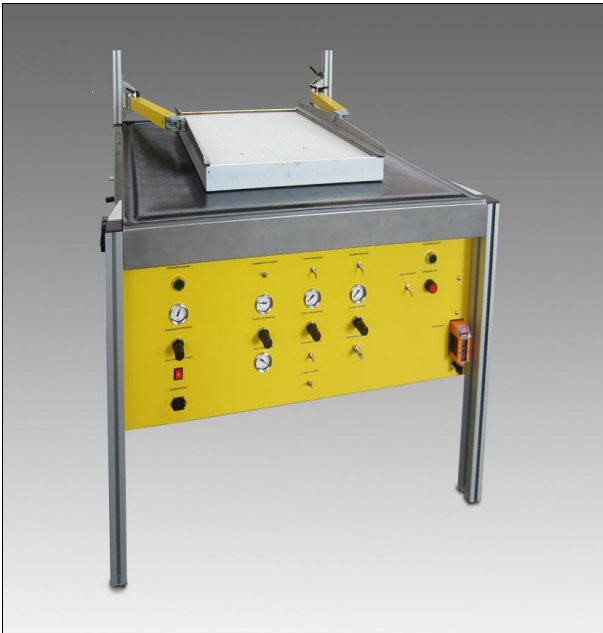
Test rig for oil thread test AFS 155

The oil thread test is used for visual proof of the absence of leakage of HEPA filters. This simple quality test procedure may be an alternative to the scan method.